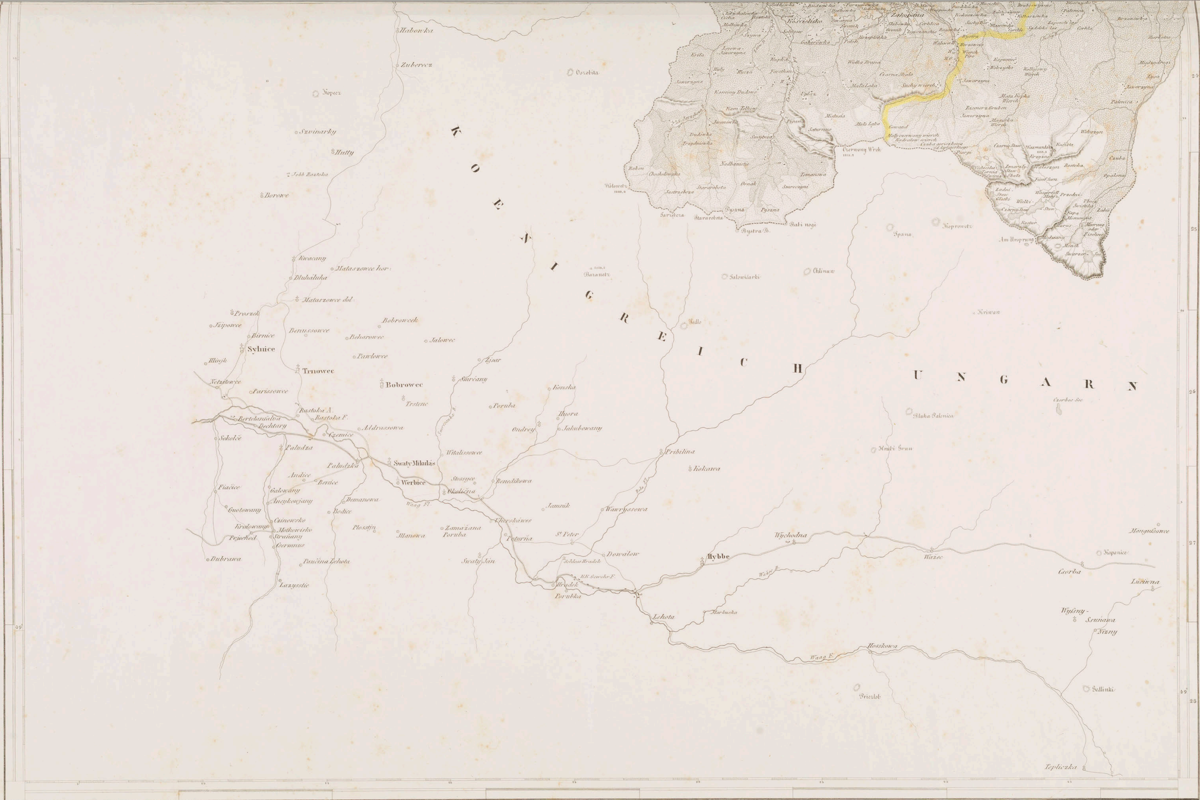
Maafstab 1:100,000. Meile gleich 2 1/2 Wiener Seil.